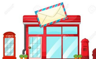
7.- post office