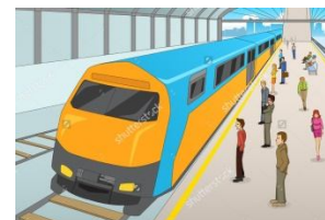
8.- train station