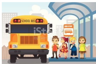
1.- bus stop