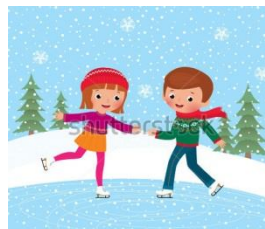
3.- skating rink