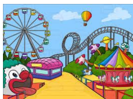
6.- amusement park