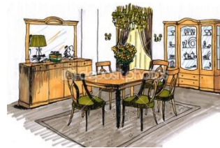
3.- dining room