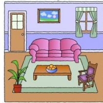
2.- living room