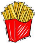
10.- French fries