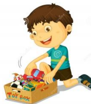
7.- tidy up