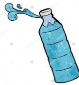
8.- water bottle