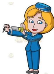
14.- flight attendant