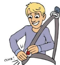
16.- seat belt