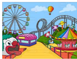
6.- amusement park