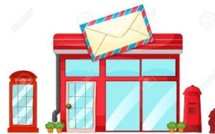
7.- post office