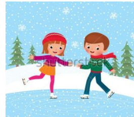
3.- skating rink