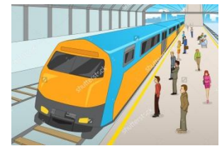
8.- train station