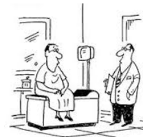
9.- health lodge