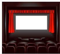
7.- movie theater