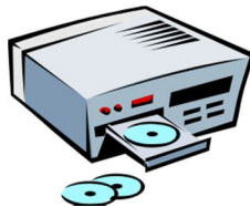
2.- DVD player