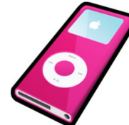
4.- MP3 player