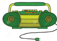
3.- CD player