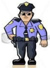
19.- police officer