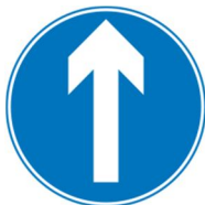
5.- go straight on