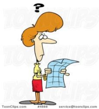
1.- read a map