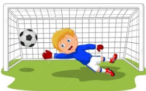
5.- score a goal