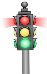
2.- traffic light