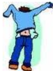
3.- get dressed