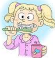
2.- brush my teeth