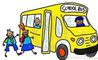
7.- catch the bus