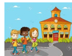
8.- walk to school