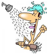
1.- have a shower