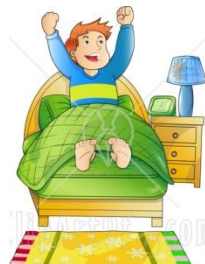
6.- get up