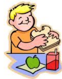
4.- have breakfast